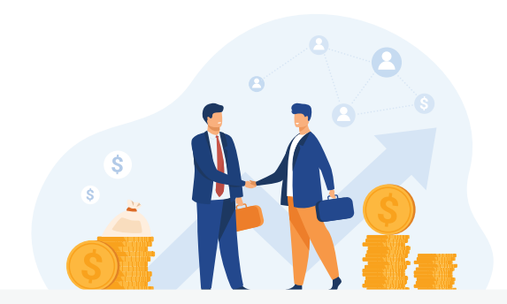
Secure Office Vault

Extra intelligent security for sensitive data e.g ATM, customer bank details etc